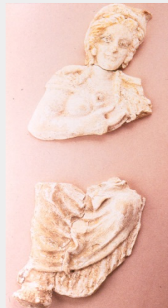
Inv. 6-20448