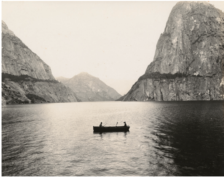
Hetch Hetchy Valley [left] and Hetch Hetchy Reservoir [right]