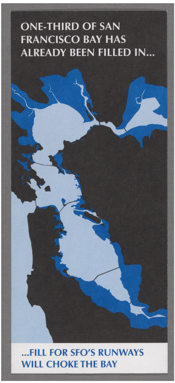
Save The Bay pamphlet

The second section in the exhibit highlights the Save San Francisco Bay movement and the creation of the San Francisco Bay Conservation and Development Commission, or BCDC. With the rise of another development boom in the Bay Area after World War II, activists organized against plans to fill in large segments of the bay. Their movement eventually led to the creation of BCDC by the California state government. This marked two important steps in the evolution of Bay Area environmentalism. First, it gave environmental considerations a permanent place in state government. Second, it signified a balanced approach between economic development and environmental conservation. Use the questions below to further explore these events and what they meant for environmentalism in the Bay Area.