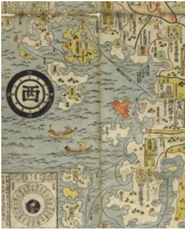
Kyūshū is, as the directional marker in the black and white circle indicates, the westernmost of the four main islands of Japan. As such, it was visited more frequently by foreign traders. Ishikawa Ryūsen, Nihon kaisan chorikuzu zu .

Mapping out the Past, continued from page 1