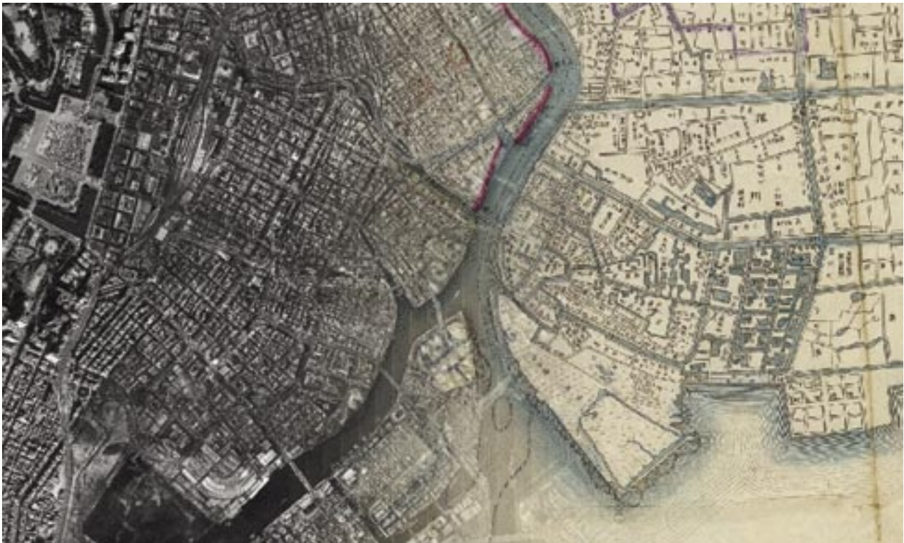
Tokyo, 1892–1985. To the right of the Sumida River is the ward of Kōtō-ku, as it appears in Kanazawa Ryōta's 1892 pocket map Shinzen Tōkyō zenzu . To the left of the river, the ward Chūō-ku, as it appears in a Russian satellite image dating to 1985. The overlay suggests that the course of the river hasn't changed much through the last century, even if the number of bridges spanning it has increased. The imperial palace can be seen in the upper left of the satellite image.

out on tatami for reading. Other formats, such as folding screens and hand scrolls, are large, or long, by nature. To prepare such items for electronic publication, Cartography Associates takes multiple digital photographs that David Rumsey then stitches together, a process requiring equal parts of skill and patience.