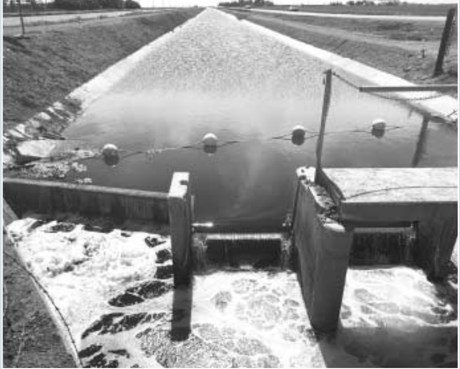
Construction of San Luis Drain, above, began in 1968, but was halted in 1975.

The identified ultimate salt disposal options by USBR are the Pacific Ocean or Delta (out-of-valley disposal options) or landfills (in-valley disposal). The in-valley disposal option, however, requires evaporation basins as a component of the system prior to disposal in