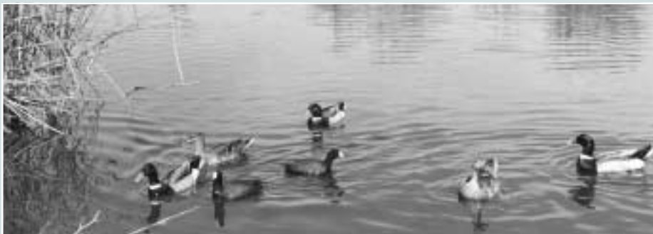
Drainage ponds' hazard to birds is their biggest drawback as an ag drainage solution.

Reuse appears as an economically promising solution to the drainage problem. Positive net returns are achieved while maintaining overall hydrologic balance in the system. Economic efficiency and hydrologic balance may be attained through pricing or market schemes. With pricing, growers are charged for