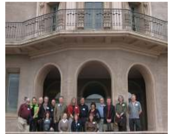
MLA/NCC meeting at Stanford University, April 2010