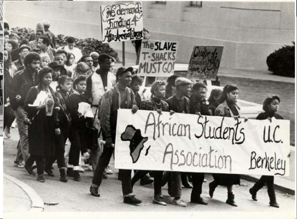
Below: UC Berkeley African Students Association marching in front of California Hall, (source and date unknown).