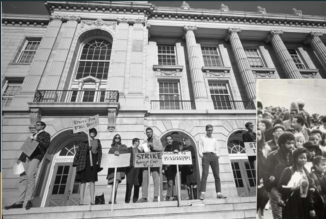
Above: Students on Sproul Steps holding protest signs, 1964, Helen Nestor Free Speech Movement Photographs, Oakland Museum of California, Calisphere.